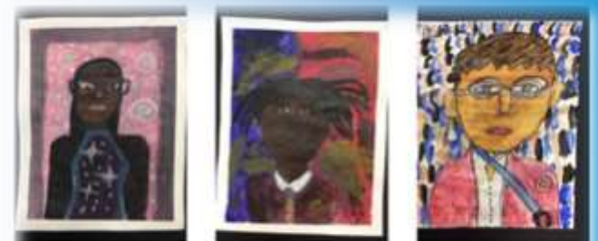
Portrait 8 Portrait 9 Portrait 10

Excellence in how we worship, learn and work together!