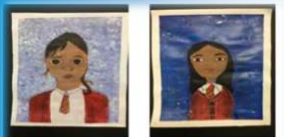
Portrait 12 Portrait 13