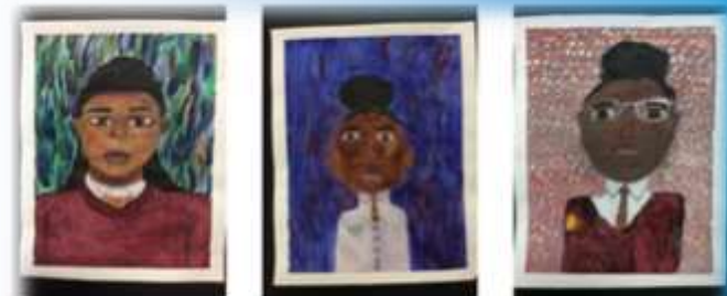
Portrait 4 Portrait 5 Portrait 7