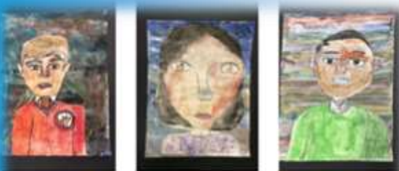
Portrait 1 Portrait 2 Portrait 3

Well done to all the children who took part!